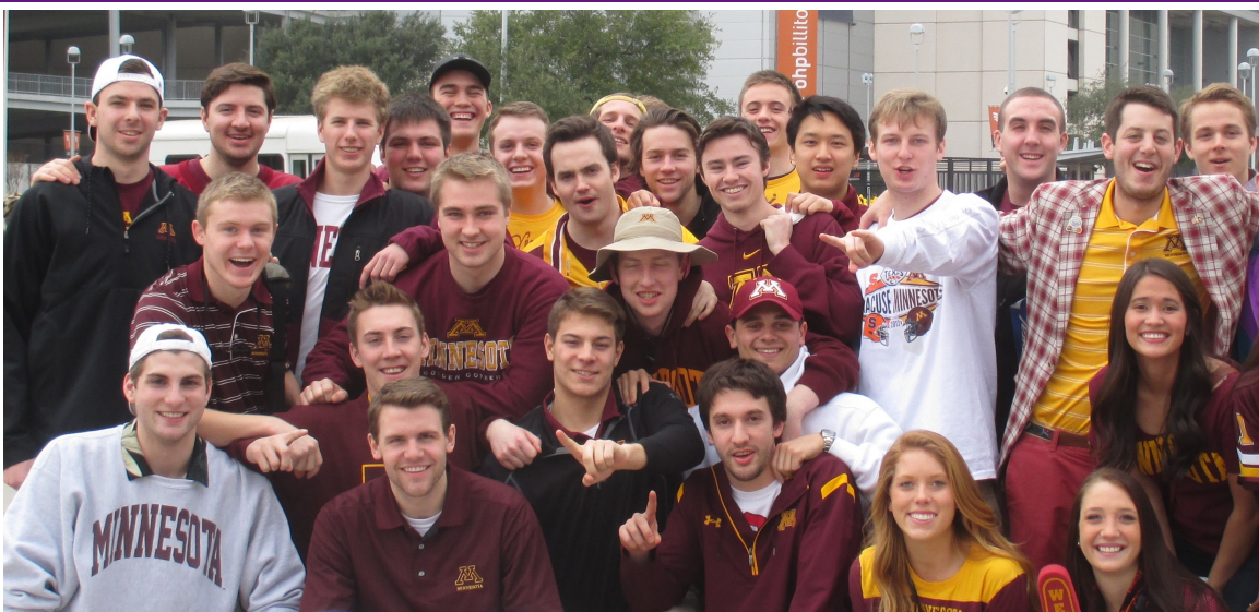
Minnesota Alpha attends the Texas Bowl